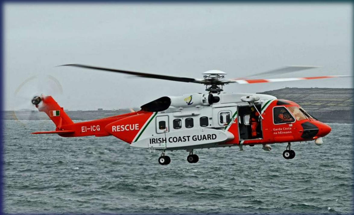
Irish Coast Guard - Garda C sta na h ireann